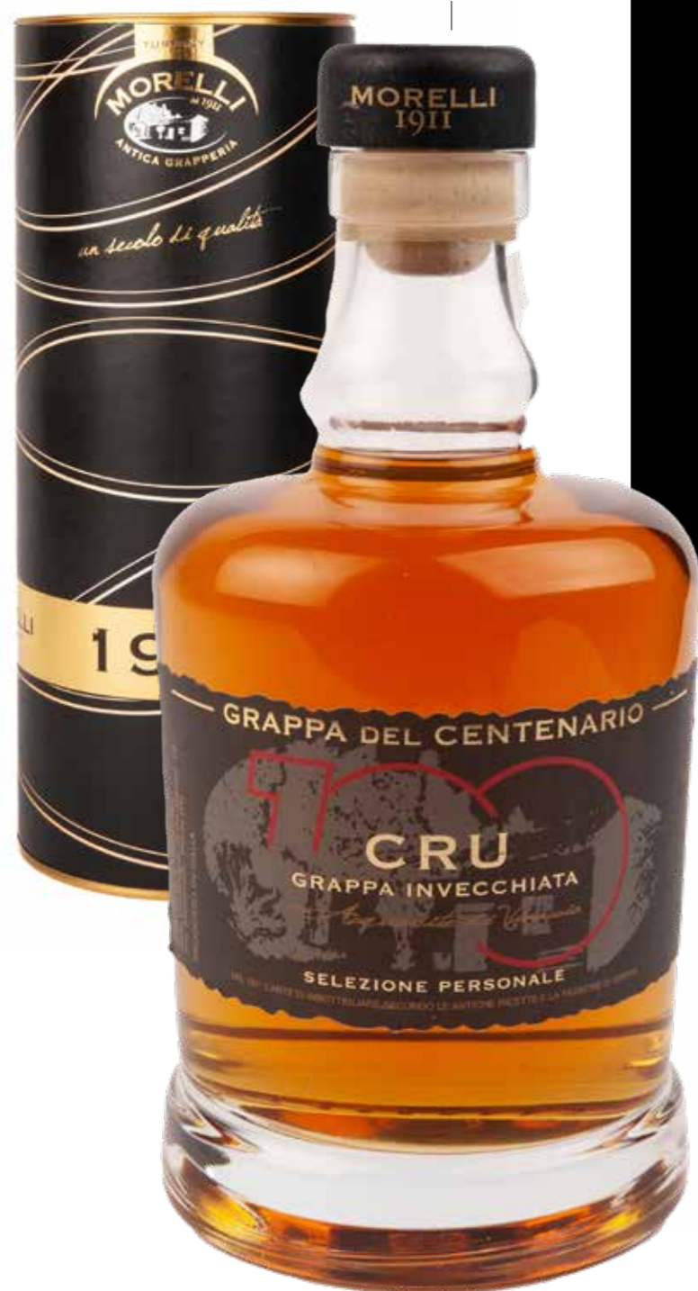
Grappa Centenario N57