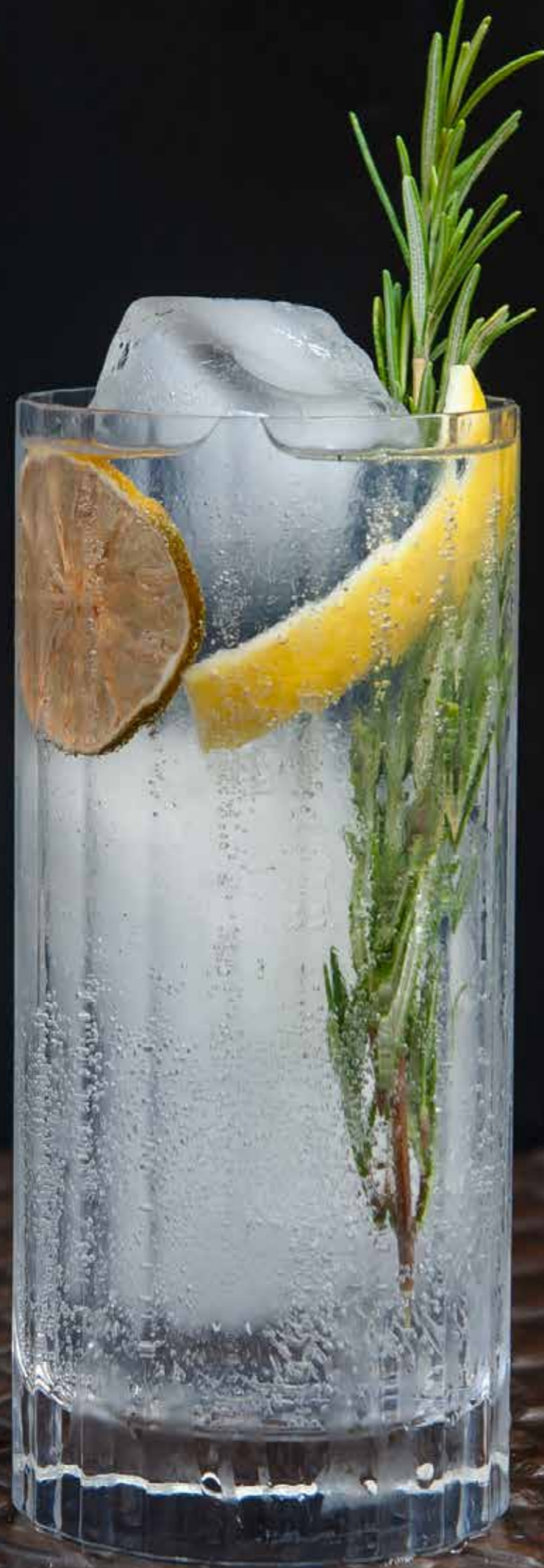
1,0 L Cod. 2132

Enjoyable neat, it truly shines as the key ingredient in celebrated cocktails.