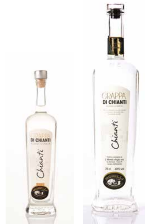
Bianca 10 Cl Cod. N17 —

Single-varietal Tuscan grappa, obtained through continuous distillation of pomace from grapes used in the production of Chianti wine.