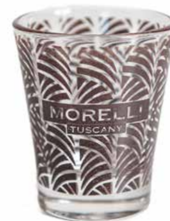
Liqueur Shot Glass Cod. N139