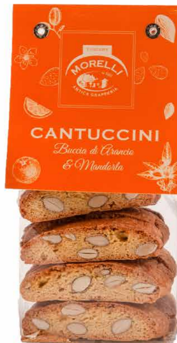
Cantuccini with Orange Peel and Almond