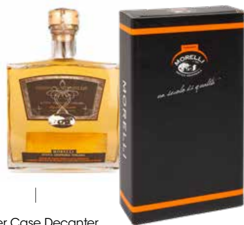
Paper Case Decanter Cod. 2115