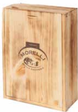
Wooden Case decanter Cod. N120