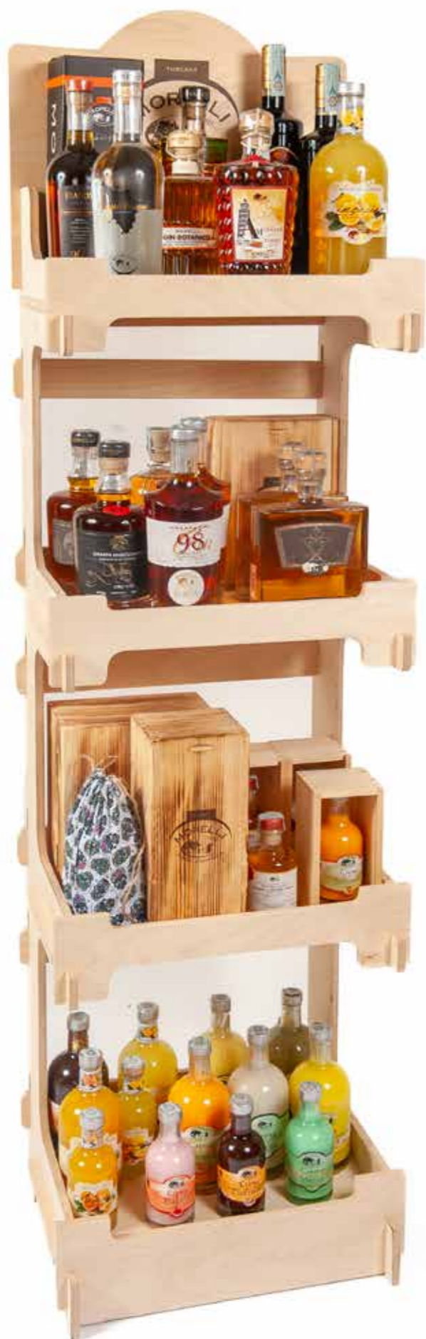
Shelving Cod. N135