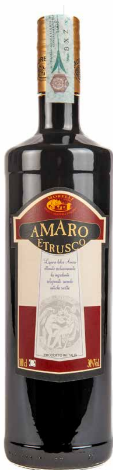
Aamro etrusco N169/1

Liqueur made by blending water with sugar and natural flavorings derived from the processing of natural aromatic herbs, which give it its distinctive flavor.