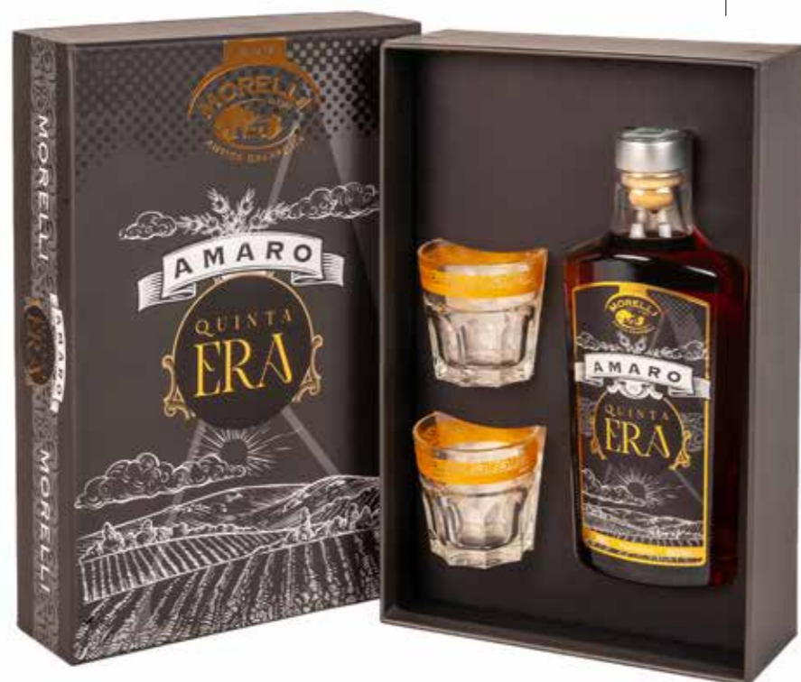
Amaro V Era Box + 2 Glasses N151