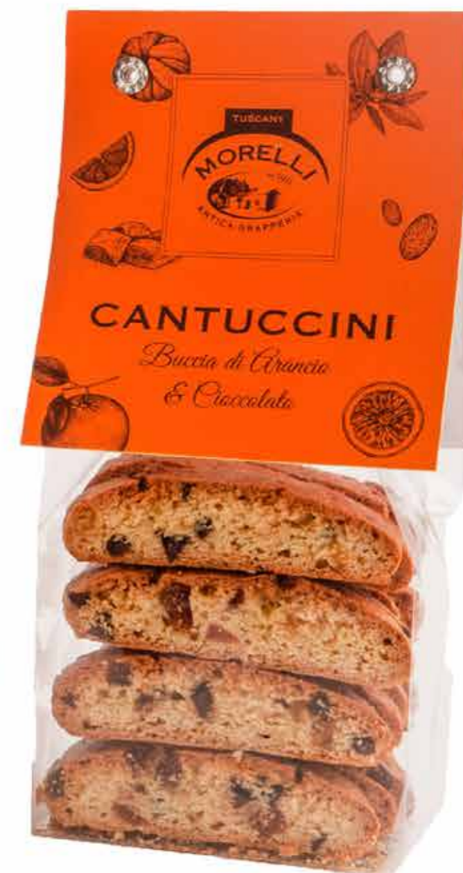
Cantuccini with Orange Peel and Chocolate