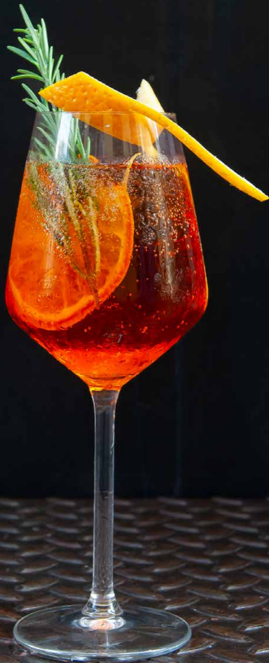
150 Cl Cod. 2134

Tradition continues—now dressed in a contemporary style.