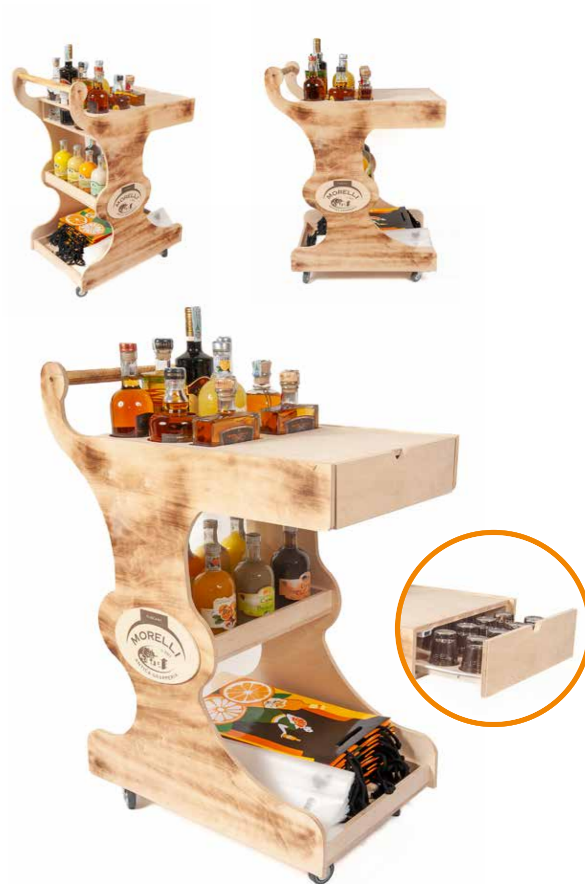
Wooden Cart Cod. N136