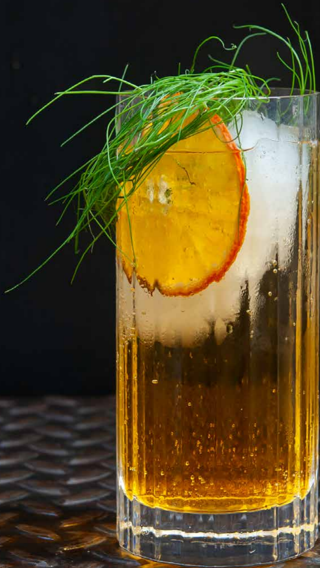
100 Cl Cod. 2135

Aperitif liqueur with a bright orange color and an apricot flavor that finishes with a citrusy touch from bitter orange. This vividly colored beverage differs from the previous version starting from its grain-based foundation. On the palate, it offers a harmonious roundness, revealing a distinctive apricot taste followed by a bitter orange finish that lingers pleasantly. Perfect to enjoy both neat or mixed.