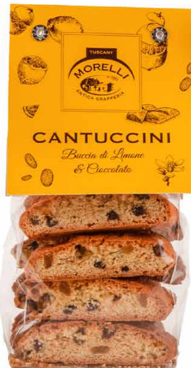
Cantuccini with Lemon Peel and Chocolate