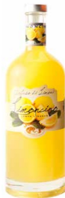
Paper Case 1lt Cod. 2114