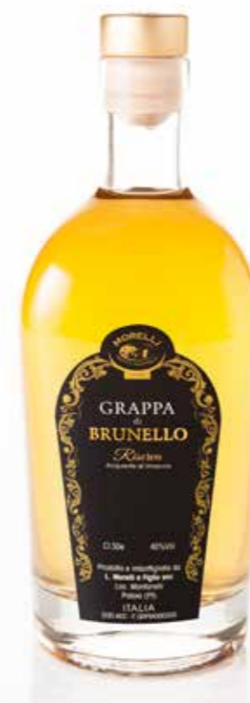
50 Cl Cod. N29

Single-varietal Tuscan grappa, obtained through continuous distillation of pomace from grapes used in the production of Brunello di Montalcino wine.