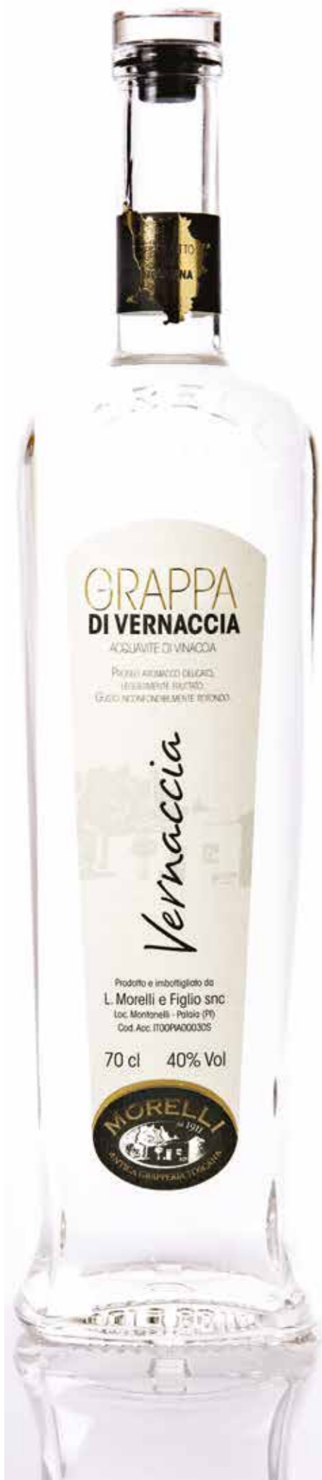
70 Cl Cod. N32

Single-varietal Tuscan grappa, obtained through continuous distillation of pomace from grapes used in the production of Vernaccia di San Gimignano wine.