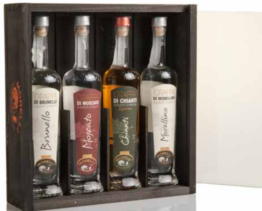
Case for 4 Single-Varietal Grappas cl 10 Cod. N126