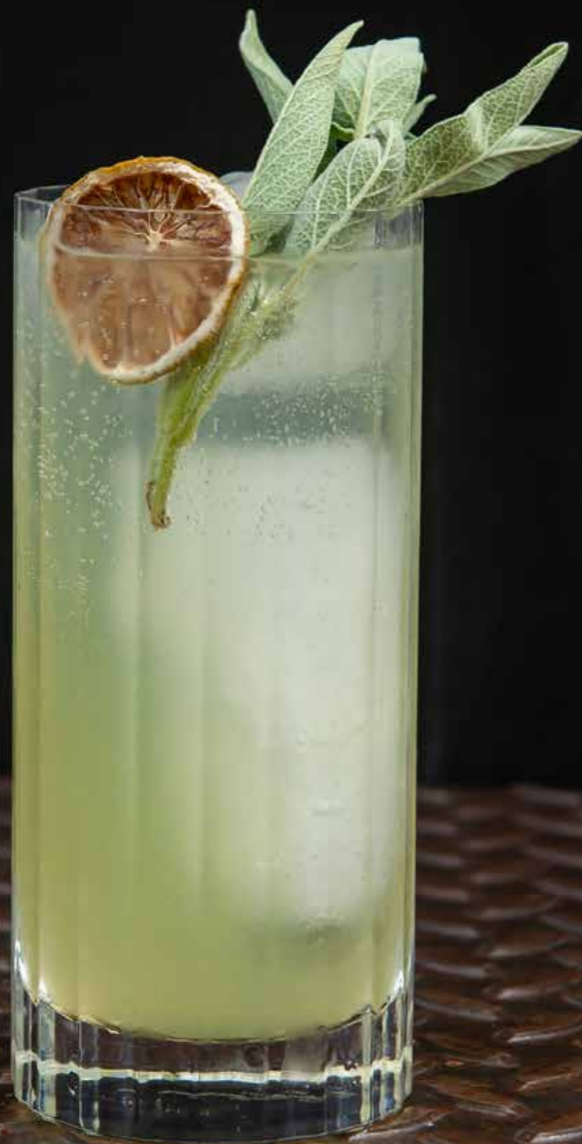
100 Cl Cod. 2136

This liqueur was first launched in France in 1834, and from that moment on, companies in various countries began producing it. Its widespread popularity quickly followed, driven by its remarkable versatility, which soon made it one of the most widely used beverages in cocktail creation.