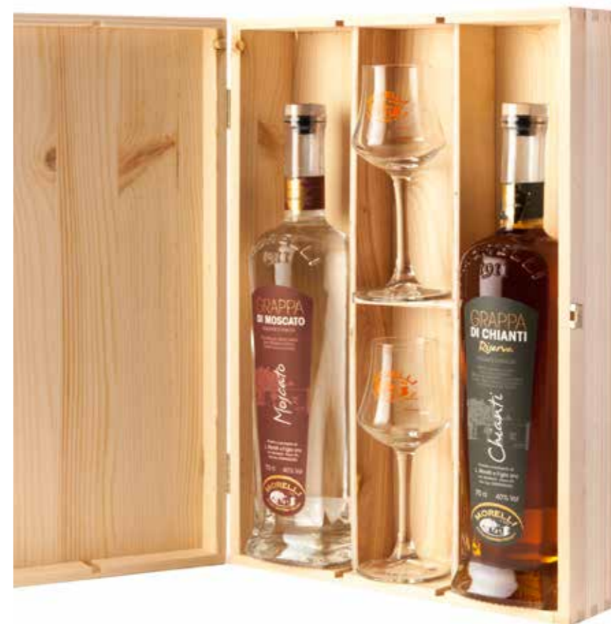
Case with Two Glasses and Two Bottles Cod. N117