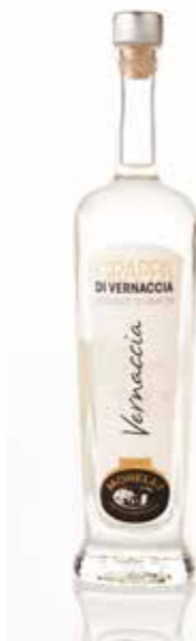
10 Cl Cod. N33