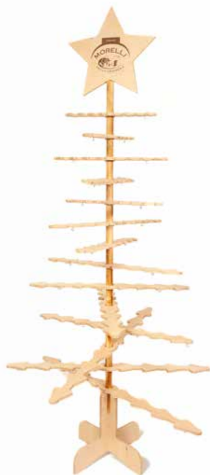
Christmas Tree N2024

This wooden Christmas tree, nearly 1.90 meters tall including the star, is a practical and elegant way to decorate your store with a colorful and original display of our Panettoni. Easy to assemble, it features 36 hooks that can hold up to 36 Panettoni.