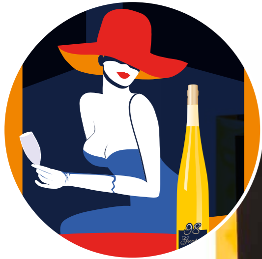
Large Shopper Bag Cod. N144