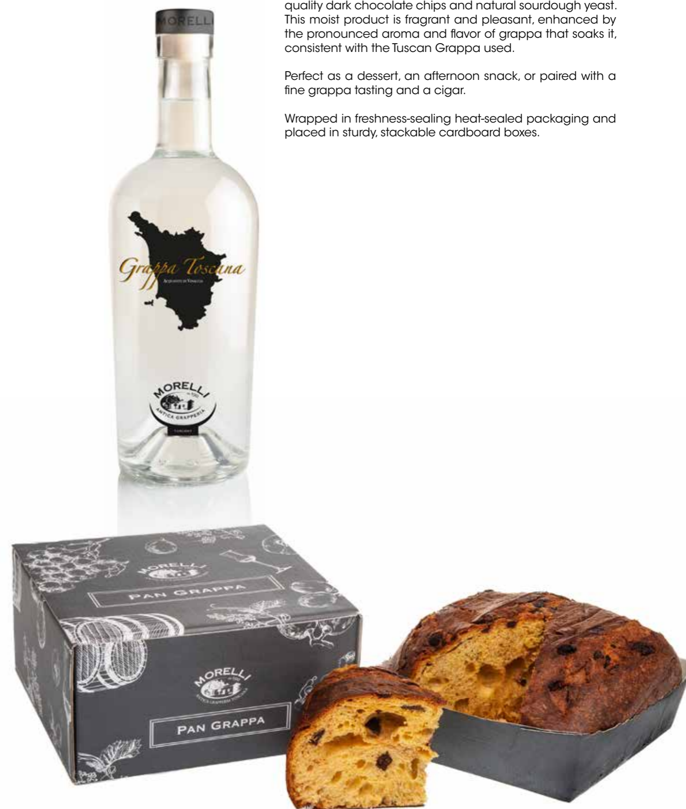
520 g Cod. 1007

Wrapped in freshness-sealing heat-sealed packaging and placed in sturdy, stackable cardboard boxes.