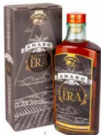
Paper Case Amaro V Era Cod. N150