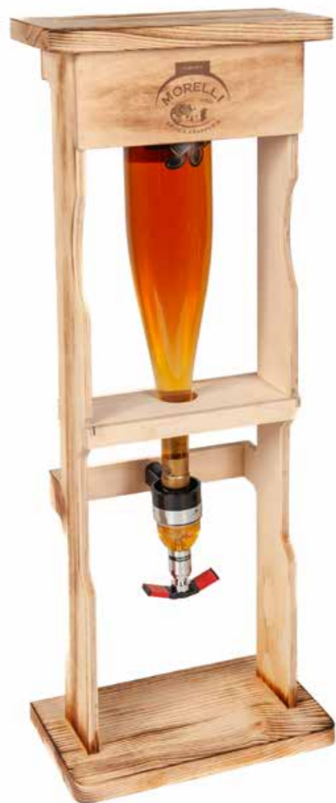
Single-Spout Pourer Cod. N132