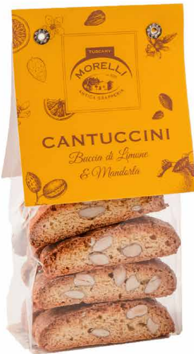
Cantuccini with Lemon Peel and Almond