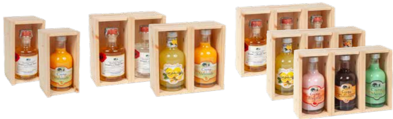
Wooden Case decanter Cod. N120